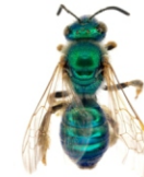
Green Halictid Bee