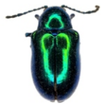
Dogbane Leaf Beetle