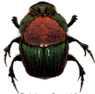
"Rainbow Scarab" Dung Beetle