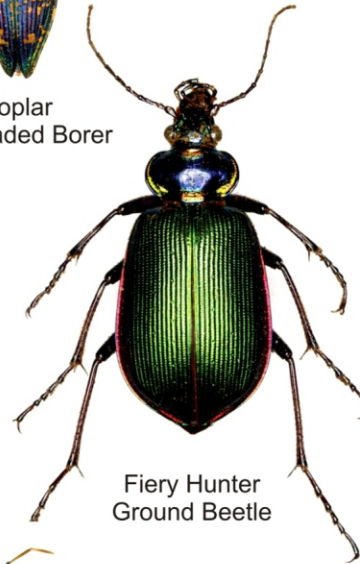
Fiery Hunter Ground Beetle