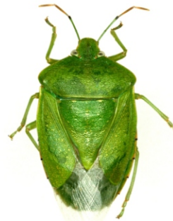
Green Stink Bug