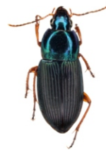
Blue-Green Ground Beetle