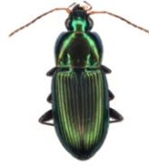
Green Ground Beetle