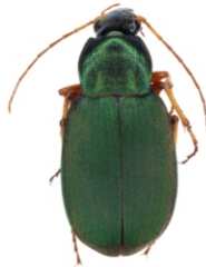
Green Ground Beetle