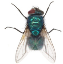
Green Bottle Fly

There are many bright metallic-green insects in Nebraska, but the emerald ash borer beetle is only a half-inch long and strictly associated with ash trees.