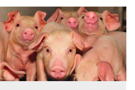
Swine and poultry are the two fastestgrowing segments in the livestock industry in Nebraska.