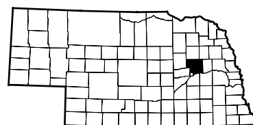
County Location Map