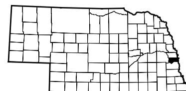
County Location Map