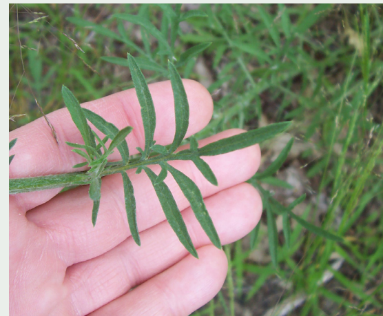
Leaves are deeply divided (pinnatifid).

Chemical control, rather than biological control, is recommended for small infestations of knapweed. Although properly managed grassland will slow the spread of knapweed, these pastures and haylands must still be continually monitored to ensure that a lone knapweed plant doesn't go to seed and cause a major infestation.