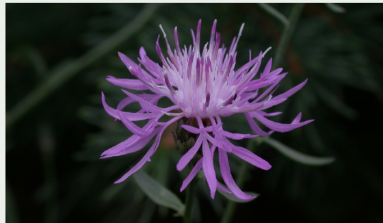
Disk florets are pink to lavender, and those on the margins are enlarged (1.5–2.5 cm).

Experiments, using several types of insects which are natural enemies of the knapweed, are being conducted to assist in controlling the spread of these plants. Difficulty in obtaining and establishing these insects has made biological control a slow, but promising, method of control. Biological agents used to control noxious weeds shall be as effective as the use of herbicides and shall be approved by your local county weed control authority.