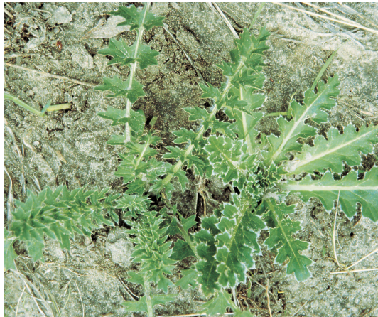
Leaves of the plumeless thistle rosette (left) differ from those of the musk thistle rosette (right) by having deep serrations to nearly the midrib.

Plumeless thistle was first identified in Nebraska in 1930, when a botanical survey found this plant in Lancaster County. Landowners and producers spend thousands of dollars each year to control plumeless thistle. This plant competes for water and nutrients while depleting grass and forage which is utilized by livestock, wildlife, and recreationists. We can all do our part by controlling plumeless thistle infestations, or by reporting uncontrolled infestations to your local county noxious weed control authority.