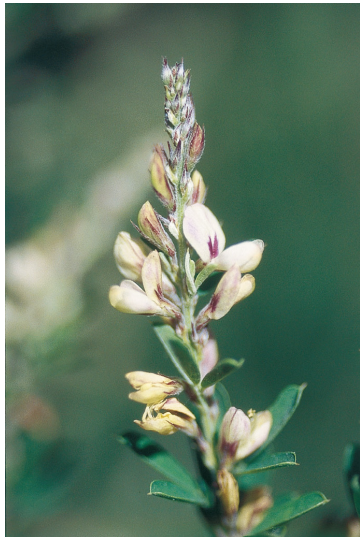
Flowers are white or cream to yellowish-white, and the veins of the banner petal are marked with dark purple or pink.

Sericea lespedeza competes with native grasses, thus reducing the carrying capacity of forage animals.